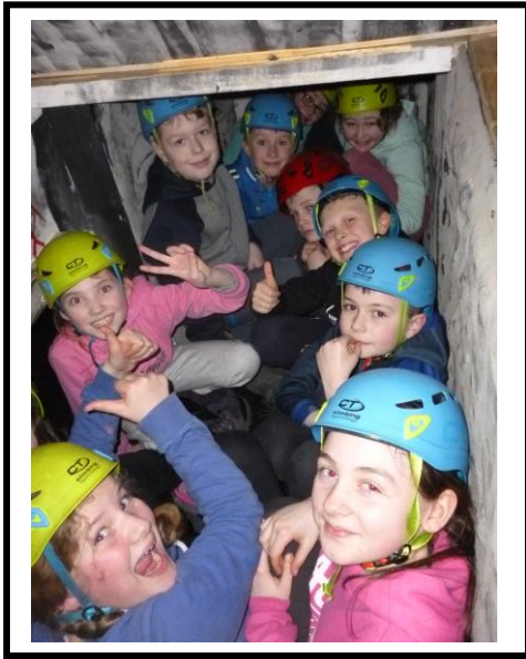
Year 5 caving at Robinwood.

Wider opportunities music sessions in Year 5 provide all children with the opportunity to learn to play the guitar and many children take advantage of a wide range of peripatetic music opportunities throughout all year groups.