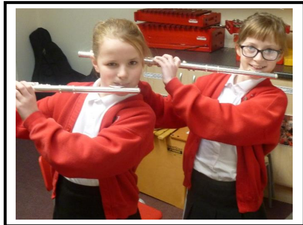
Learning to play the flute.

Wider opportunities music sessions in Year 5 provide all children with the opportunity to learn to play the guitar and many children take advantage of a wide range of peripatetic music opportunities throughout all year groups.