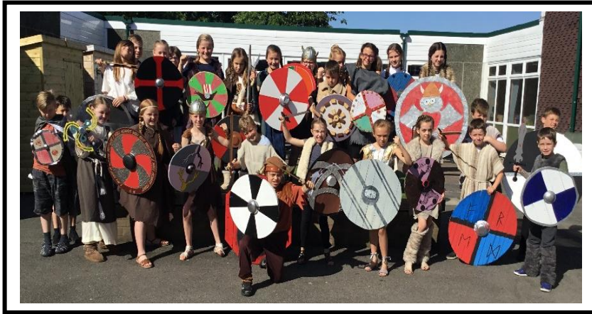
Year 5 Viking Day and topic presentation. All the children made their shields as part of their project homework.

We believe that a strong home/school partnership is vital in ensuring that every child reaches their full potential and therefore organise an Inspire session in the autumn term and a topic presentation workshop in the spring for each class.