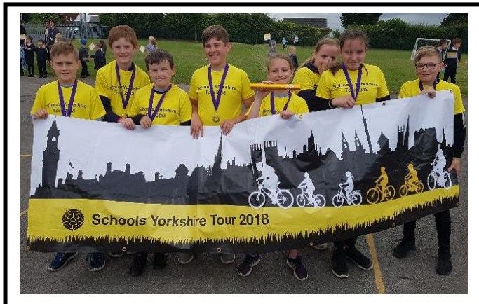
Taking part in the Schools Yorkshire Cycling Tour.

We also take a very active role in local school sport; participating in many inter-school sports tournaments.