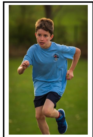
Competing in the cross-country tournament.