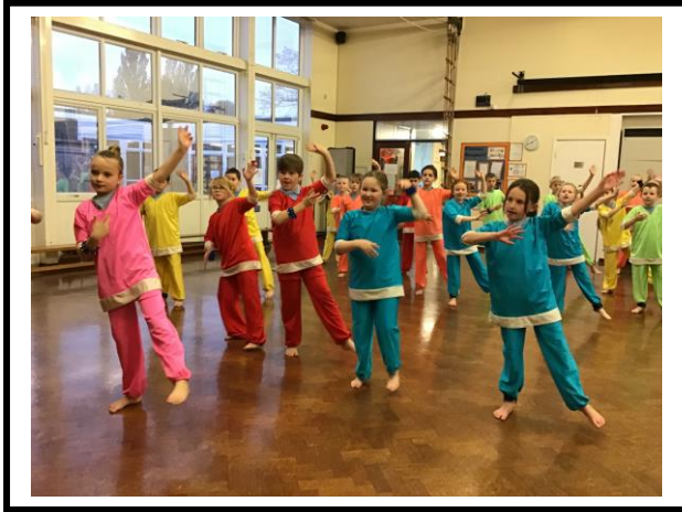
Year 4 Indian Dance workshop.

We block our subjects in termly topics, thereby ensuring that our curriculum has real-life context making links to the world around us locally, nationally and globally. However, in doing so, we ensure that the knowledge and skills of each individual subject are taught precisely and built upon in a progressive manner which leads to long term memory.