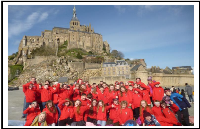
Year 6 visit to Mont St Michel.

In order to further enrich the curriculum and provide meaningful learning experiences, we organise an educational visit or visitor for all classes each term as well as subject theme weeks throughout the year, for example Science Week and Take One Picture Week. We also organise an outdoor and adventurous residential visit in Years 5 and a cultural and linguistic experience to France in Year 6.